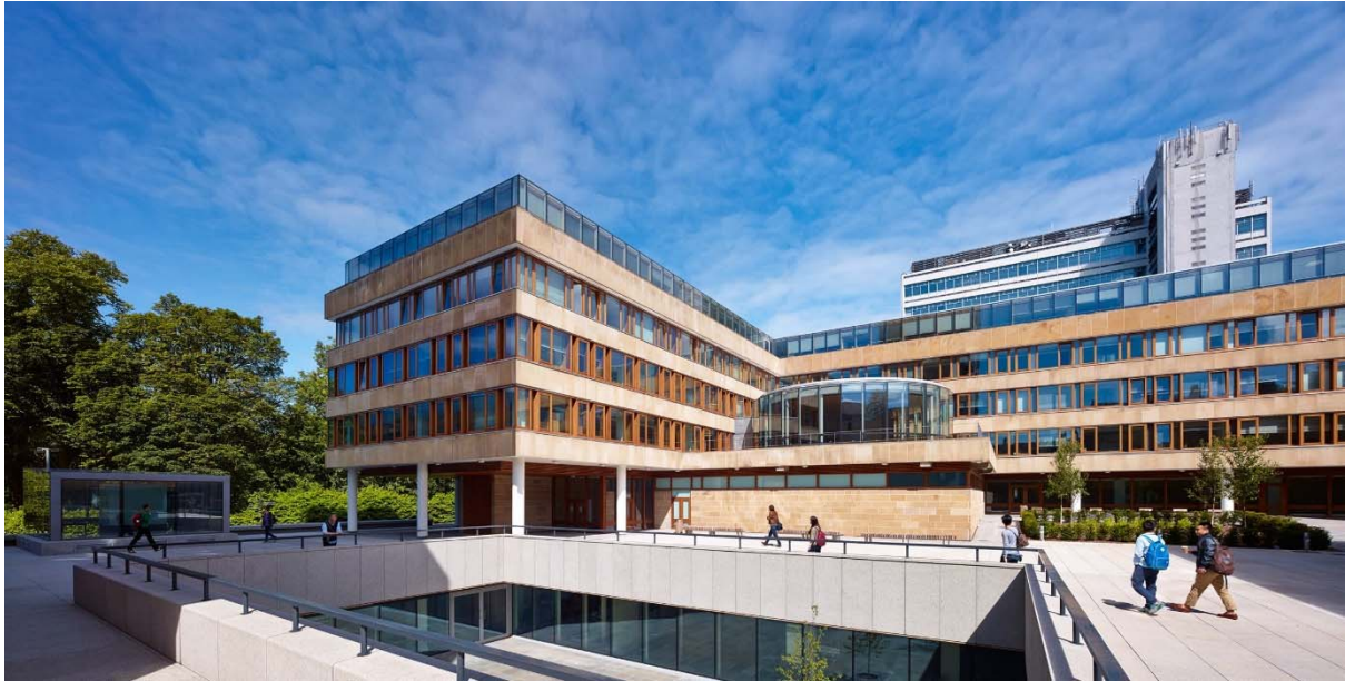
50 George Square

The Screening Room at 50 George Square is situated on the West side of George Square, in the Central Area of The University of Edinburgh. George Square was originally built in 1766, outside the then overcrowded old town, as a residential area, which enclosed a garden square. The building is within a mile of the city centre.