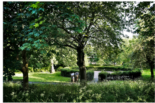
George Square Gardens

The main pedestrian access to George Square, which lies between Chapel Street and the Meadows, is from Middle Meadow Walk and George Square Lane from the West, or along Crichton Street from the East.